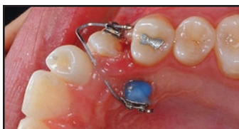
108 Forced Eruption